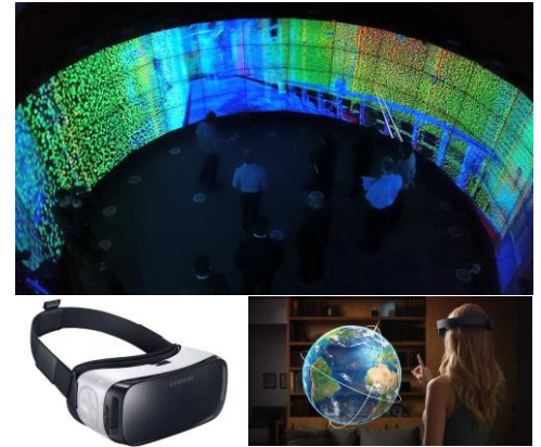
Fig 3. Emerging immersive technologies including CAVE2 at Monash University (top), Samsung GearVR headset (bottom left) and Mixed Reality with Microsoft HoloLens (bottom right)

We will build upon an existing planning-support tool, the UrbanBEATS model ( www.urbanbeatsmodel.com ), which is rapidly gaining attention in the urban water industry as a powerful and flexible tool for exploring the planning of WSUD in urban precincts. Using the industry standard Unity3D game engine ( www.unity3d.com ), we will create a highly visual and interactive gaming experience that is based heavily on tacit knowledge and experience informed by our industry stakeholders and our exploratory model.