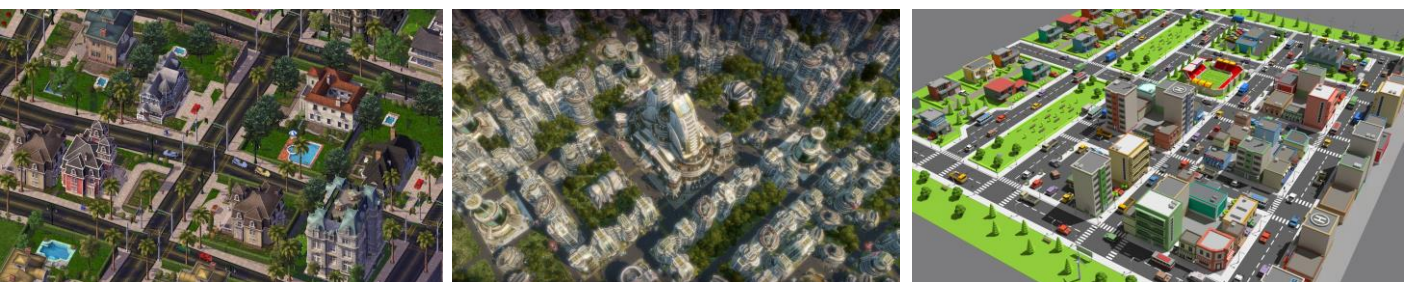
Fig 2. Examples of Gamifying the City (left - SimCity4, source: EA Games ; centre - Anno2070, source: Ubisoft, right: LowPoly City Model for Unity3d Game Engine, source: VenCreations)

New techniques in integrated modelling for sustainable urban water management are constantly being experimented with and the incorporation of social dynamics into models is becoming more common [8] . Additionally, the use of computer games and virtual reality as platforms for understanding human decision-making has gained increasing attention in the planning sphere [10-12] . With a plethora of visual styles and simulation games emerging from the gaming industry (see Fig. 2 for examples), there is a huge opportunity to explore the use of these in advancing the modelling and interdisciplinary science of WSUD management.